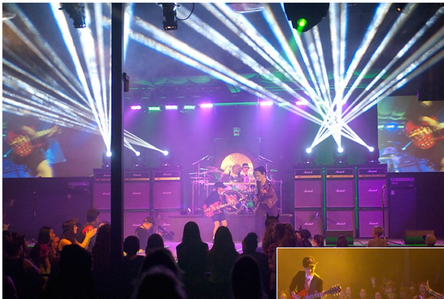
V 2 delights their fans with an amazing 18 song, rock show of epic proportions!